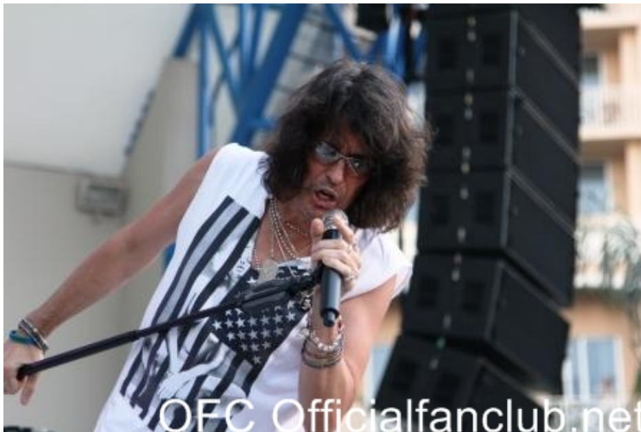
Foreigner at SunFest